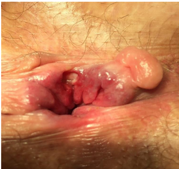
Figure 1: Chronic anal fissure complex: sentinel hemorrhoid, fissure with raised edges and hypertrophic papilla.