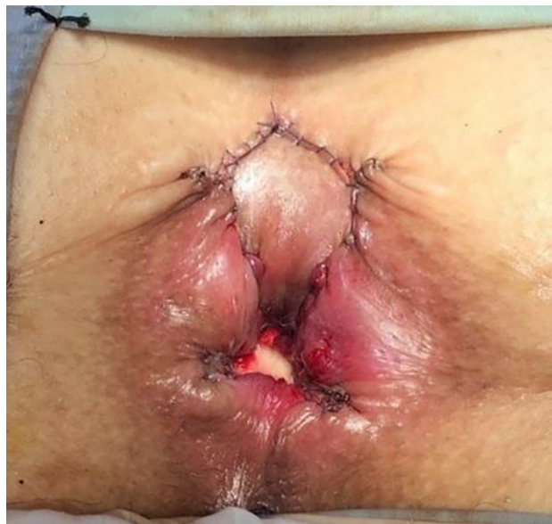
Figure 3: Subcutaneous pedicle skin flap completely sutured.