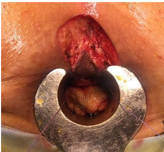
Figure 2: House flap carved and sutured to the pectinate line.